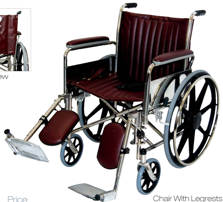
Chair With Legrests