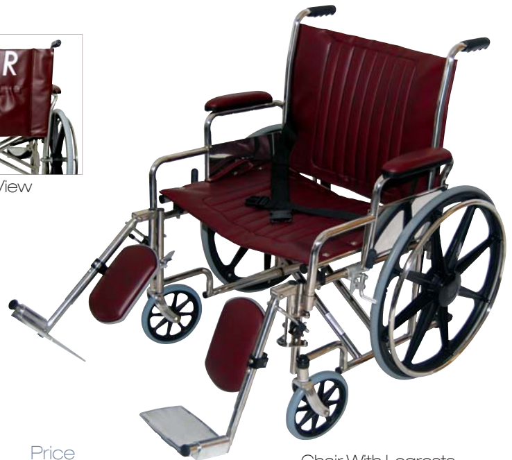
Chair With Legrests