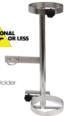
C Oxygen Tank Holder