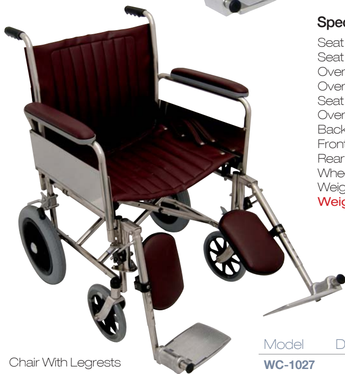
Chair With Legrests