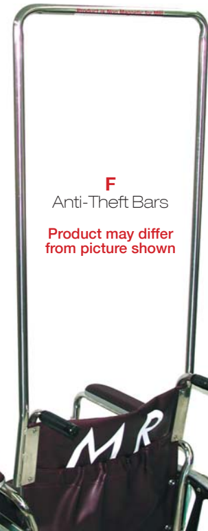
F Anti-Theft Bars Product may differ from picture shown