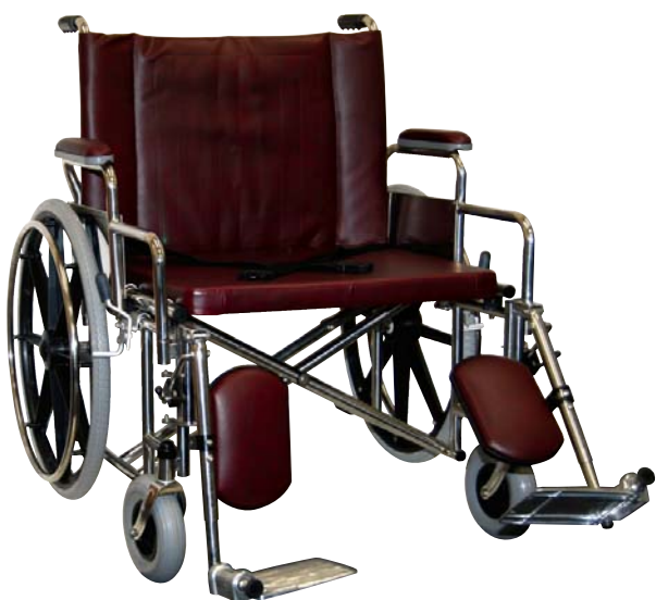
Chair With Legrests