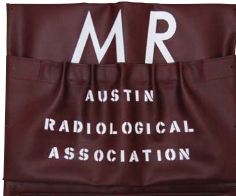
Custom Stenciling, add your company name and/or other info on back of wheelchair