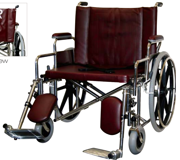
Chair With Legrests