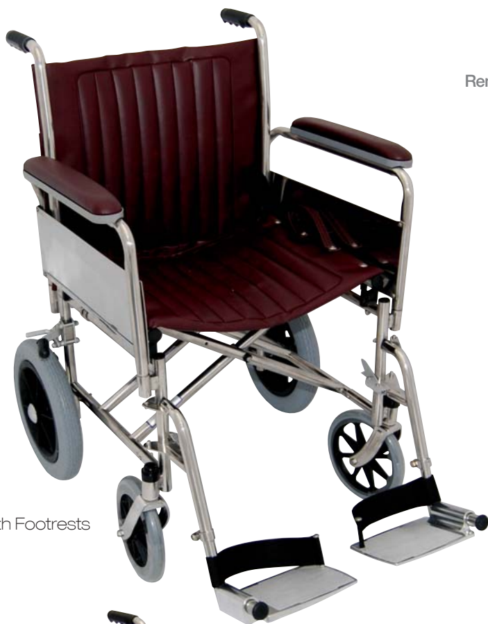
Chair With Footrests

Removable Full Length Padded Arms, Swingaway, Detachable Footrests or Swingaway, Elevating, Detachable Legrests