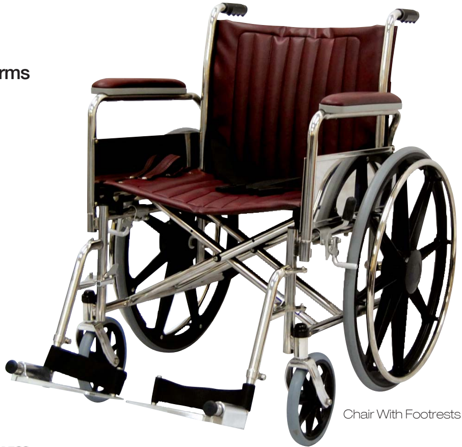
Chair With Footrests