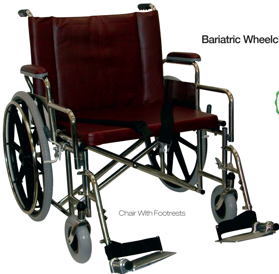
Chair With Footrests

Removable Desk Length Padded Arms Swingaway, Detachable Footrests or Swingaway, Elevating, Detachable Legrests