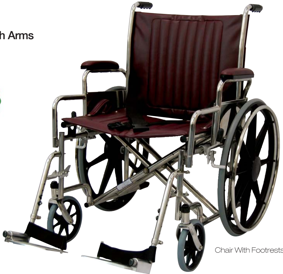
Chair With Footrests