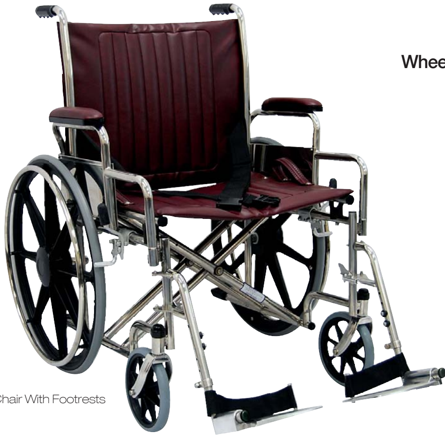
Chair With Footrests