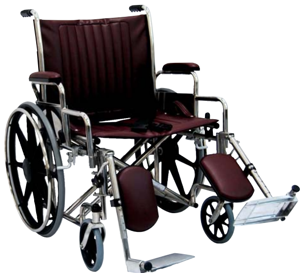
Chair With Legrests