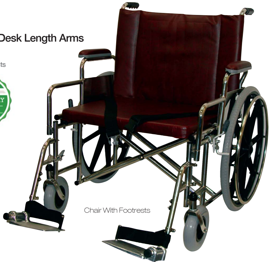
Chair With Footrests