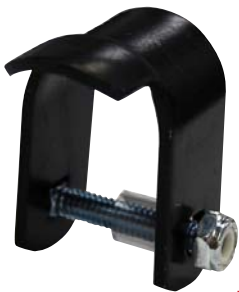
E Anti-Theft Clamps